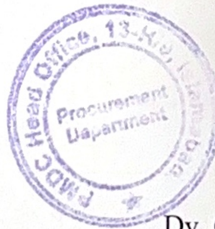
Dy. General Manager (Procurement) Phone: 051-9265128