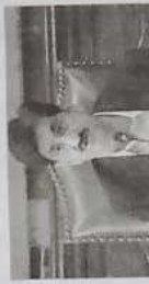
CM Murad says Karachi situation will decide market closure timings: Traders present differing views on early market closures

Representatives from Pakistan's fan industry seek policy interventions during meeting with finmin