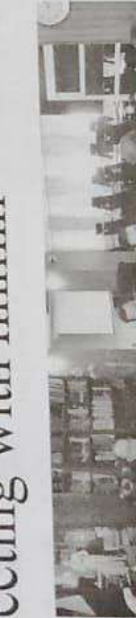
They have sought interventions to reduce the export of its raw materials