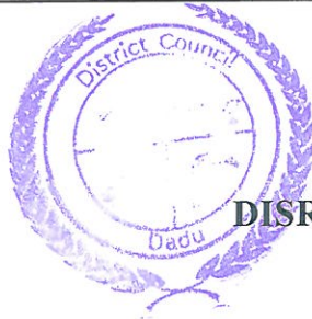
CHAIRMAN DISRTICT COUNCIL, DADU