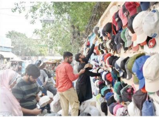
HEATING THE HEAT: A man selects a cap from a roadside vendor in the provincial capital to protect against intense sunlight during hot weather.

Further proceedings in the case are expected after the submission to a shortage of reagents by the laboratory facilities, while