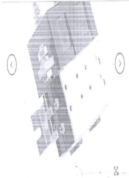
Directional Contactor 200 Amp