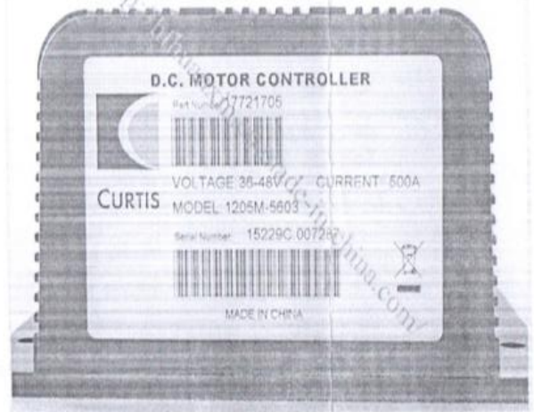
Motor Drive Controller 500A