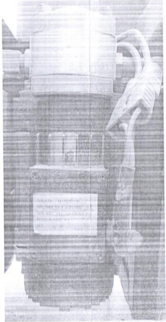
Hydraulic Steering Motor